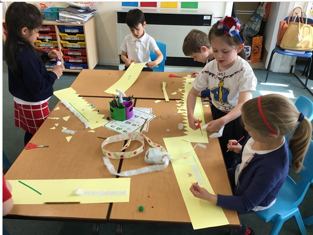
Year 1 designing Crowns