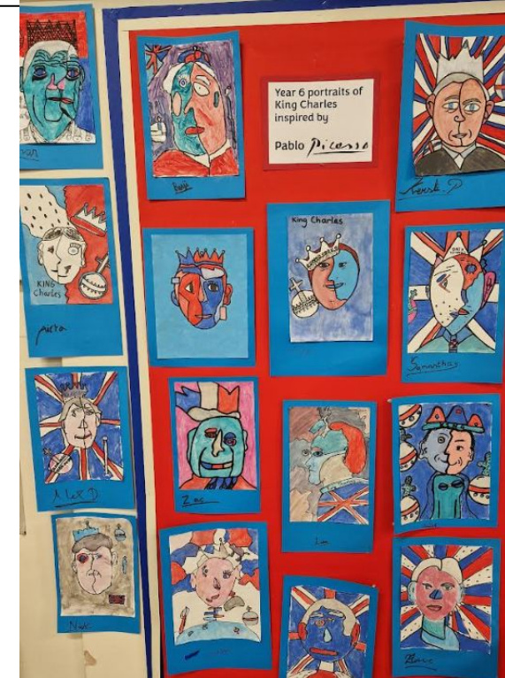
Year 6 portraits of King Charles inspired by Pablo Picasso